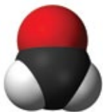
CH 2 O/HCHO molecule